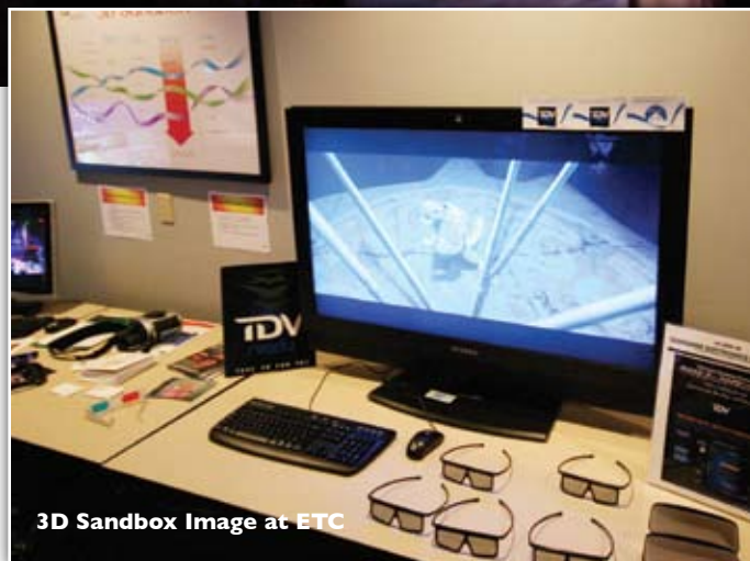
3D Sandbox Image at ETC

3D has become increasingly popular; leading more companies to incorporate the medium into their product line. As more options arise in the stereoscopic world, cutting-edge products and 3D education have created the newest industry buzz.