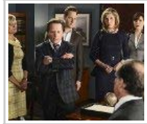
Emmys 2012: 6 Top TV Critics Make Their Picks (The Hollywood Reporter)