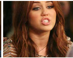
Miley Cyrus Lets It All Hang Out (Literally)