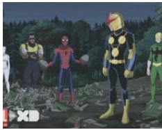
Marvel and Disney XD's Ultimate Spider-Man Sneak Peek