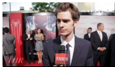
'The Amazing Spider-Man' Red Carpet Interviews... The stars of Marc Webb's reboot talk to THR about bringing the icon... | VIEW GALLERY