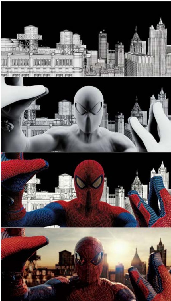
"The Amazing Spider-Man"

grows into his superpowers during the course of the movie, Imageworks has been testing its creative powers, which have grown steadily as the $2.5 billion-grossing franchise has progressed.