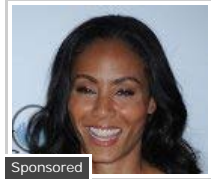
5 Celebs Whose Plastic Surgery Has Made Them Unrecognizable (PHOTOS) (CafeMom)