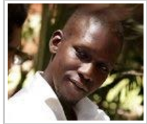
Obama Documentary Featuring President's Half Brother Opens Big at Box Office (Exclusive) (The Hollywood Reporter)