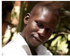
Barack Obama's Brother to Make Film Debut in Anti-Obama