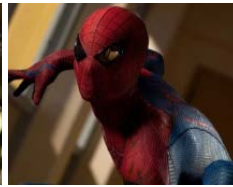
The Amazing Spider-Man 3D Trailer