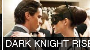
DARK KNIGHT RISES