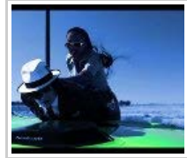
Jack White Debuts Racy Solo Clip, 'Freedom at 21' (Video) (The Hollywood Reporter)