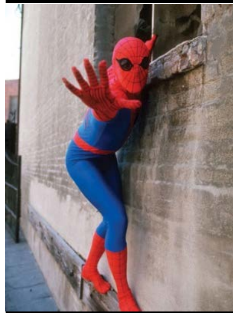
Spider-Man's 50-Year History How Peter Parker became a billion-dollar franchise. | VIEW GALLERY